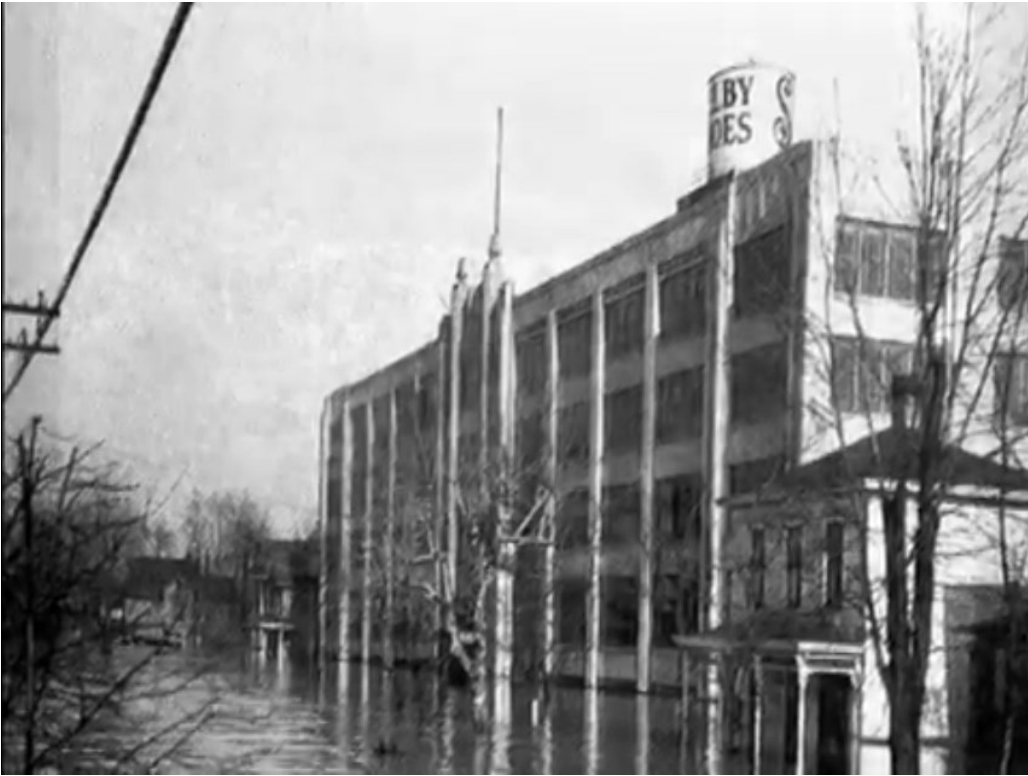
Above, the Selby Shoe Company during the 1937 flood. Below, the same building in 2015.